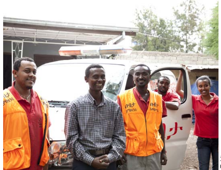
Tebita's ambulance team is prepared to serve Ethiopia

Many Ethiopians in need of emergency services cannot afford typical ambulance rates, which are often high due to substantial maintenance and fuel costs. However, Tebita finds limiting services to high-income patients to be unacceptable. Thus, the company is working to perfect a tiered-pricing and cross-subsidization model for their services. To subsidize services for the poor, Tebita pursues contracts with international organizations and multi-national companies. For instance, Tebita holds contracts with mining companies to provide emergency transport for employees located in harsh, rural settings. Tebita also partners with AMREF's Flying Doctors in Nairobi, International SOS, and Africa Assist to facilitate international evacuations, and works to provide other premium services that will attract